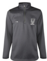
1/4 zip black top